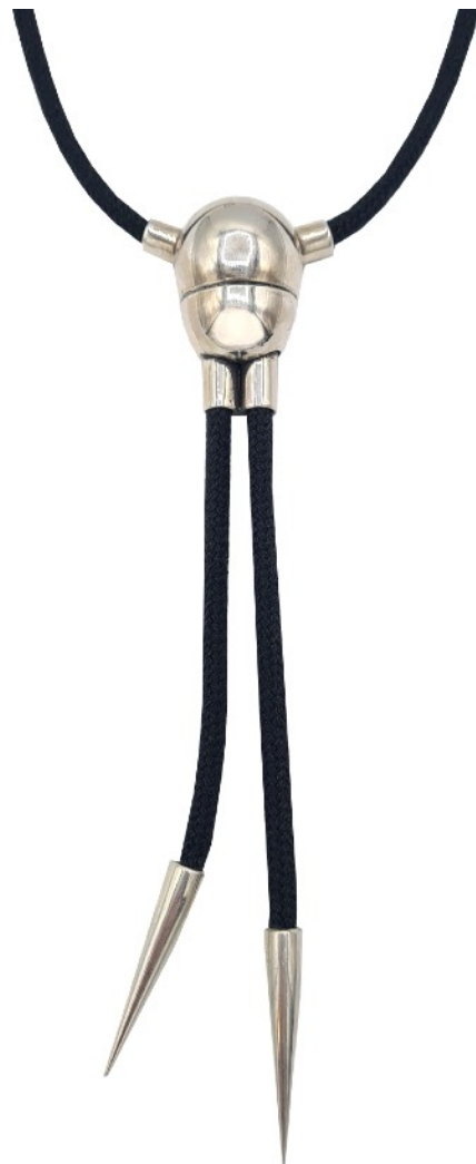
Claude Wesel Bolo 7123 in Sterling silver 2007 edition of 25 © MiniMasterpiece

In 2007, we organized an exhibition in our Waterloo gallery dedicated to his bolo-ties from which the models presented today in limited and numbered editions of 25 come.